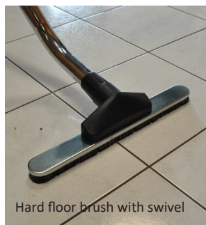
Hard floor brush with swivel