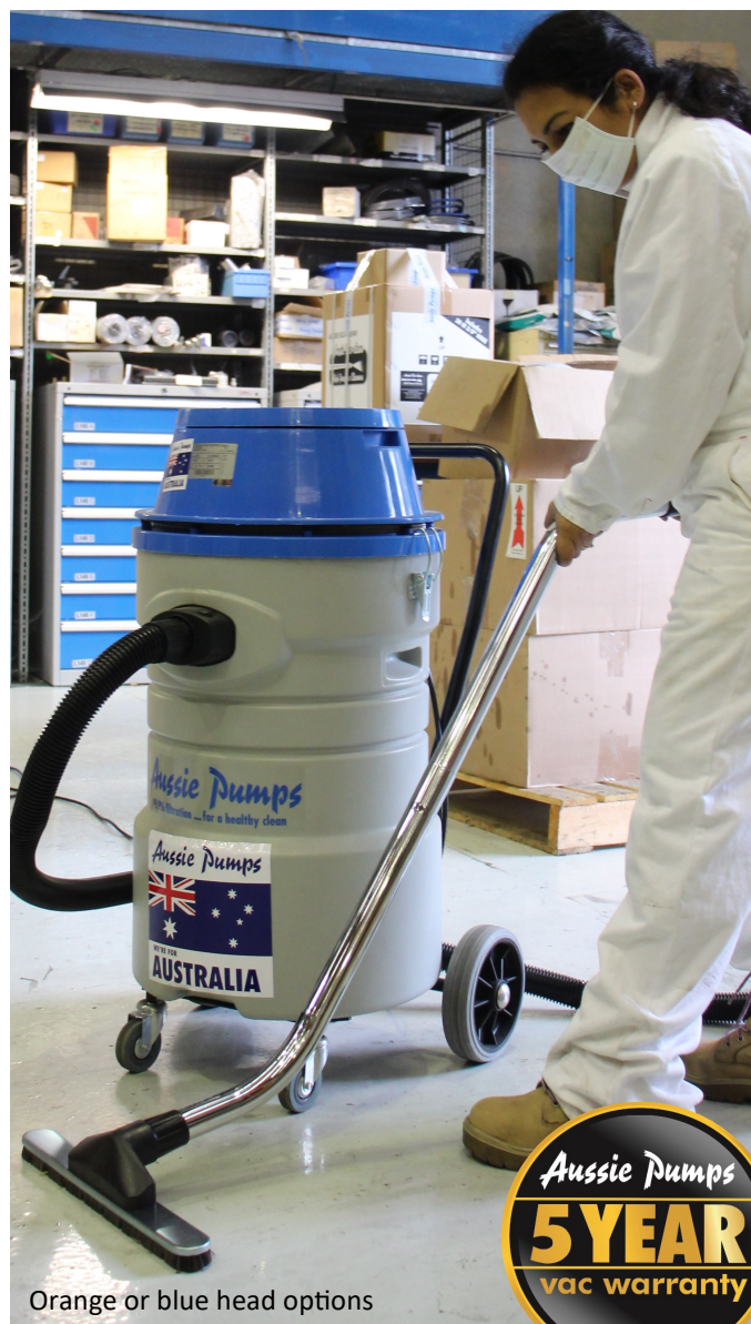
Orange or blue head options

Microweb is essential for dust from limestone, biochemical, lead, sugar, cement, Gyprock, precious metals, pigments and fertilizers.