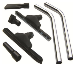
40mm accessory kit